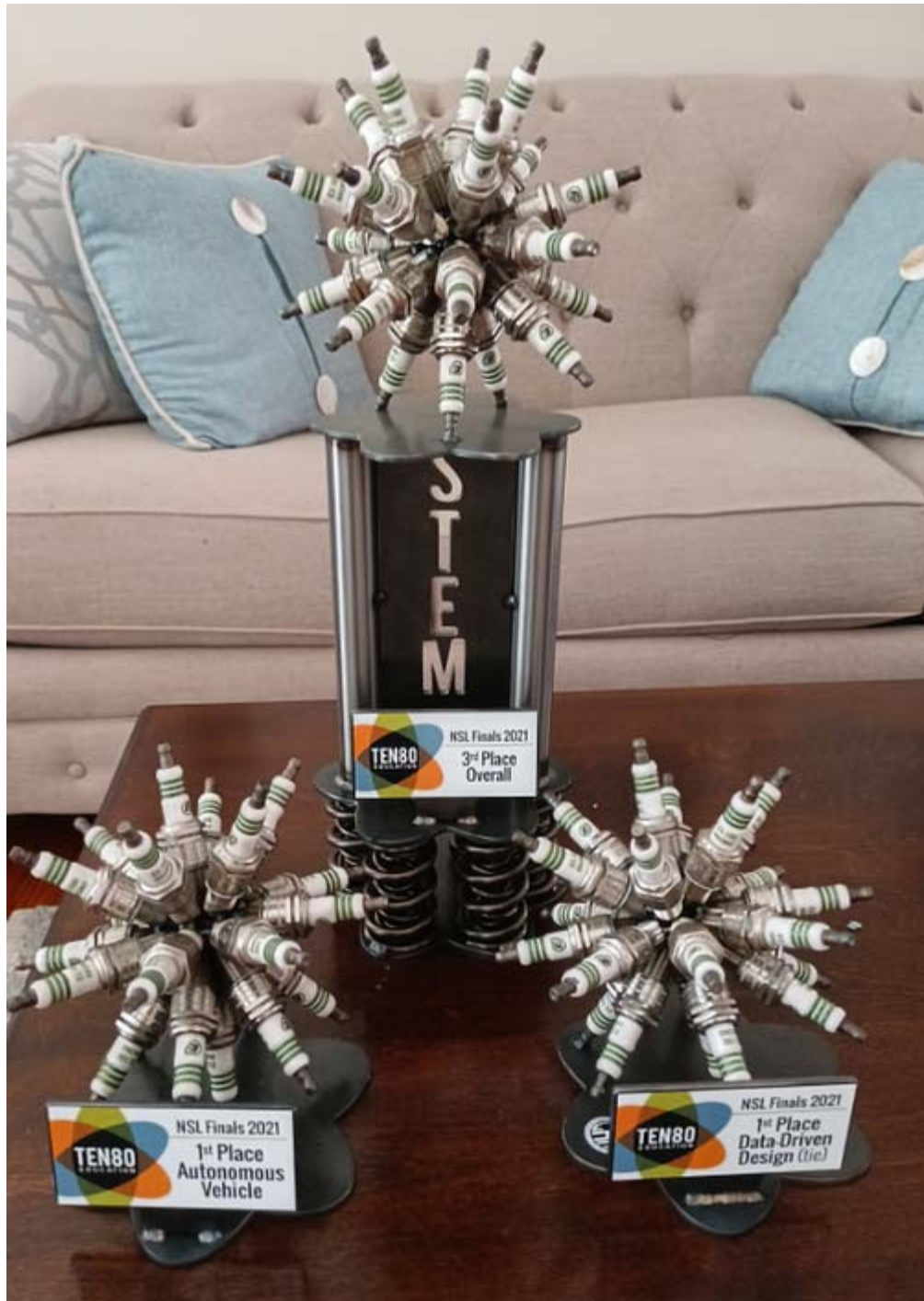
Ten80 National Competition Trophies